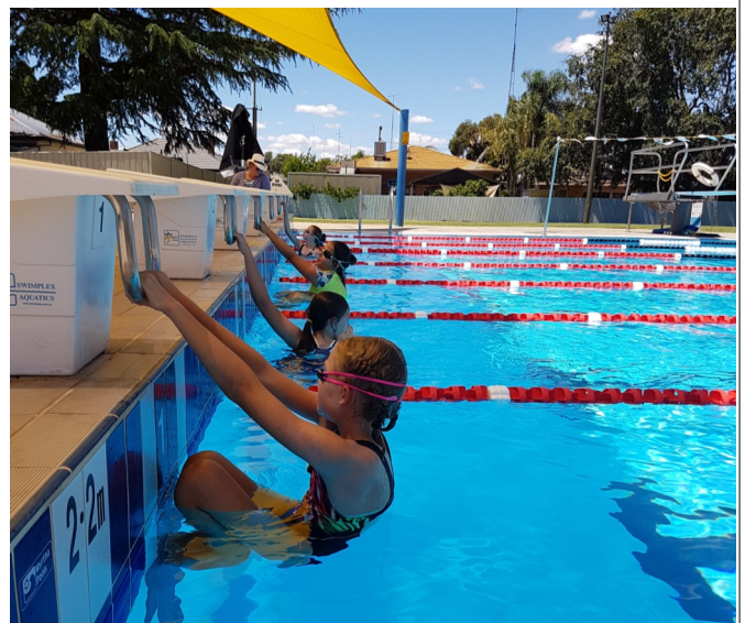
On you mark