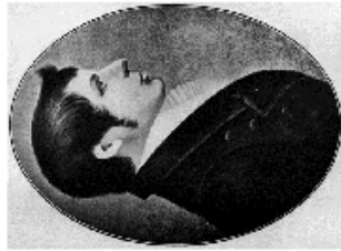
John Oxley 1784—1828