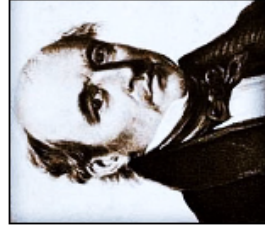
Allan Cunningham 1791—1839