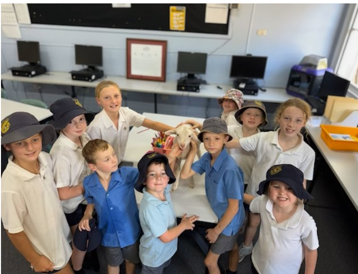
A surprise visitor to school last week!